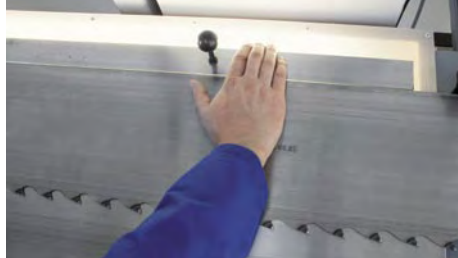
Exact inspection of back straightness with straight edge and integrated light box.