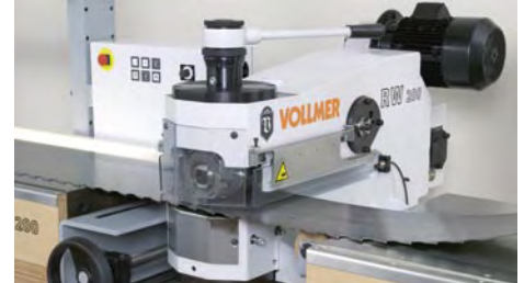
Easily positioned, robust rolling unit. Roller pressure precisely adjustable via long lever arm.

The dressing bench RB 200 and roller unit RW 200 lets you straighten and tension band and gang saw blades up to a width of 400 mm and 200 mm respectively. A robust design, perfect results, simple operation and a high level of safety were key priorities in the development of this machine, and pay high dividends in day-to-day operation.