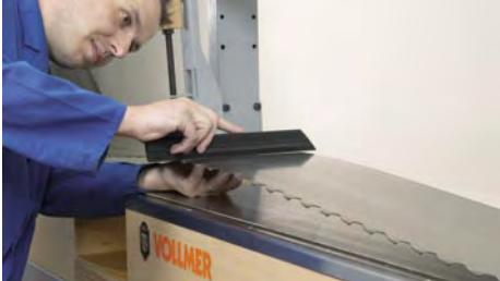
Checking the tension curve.